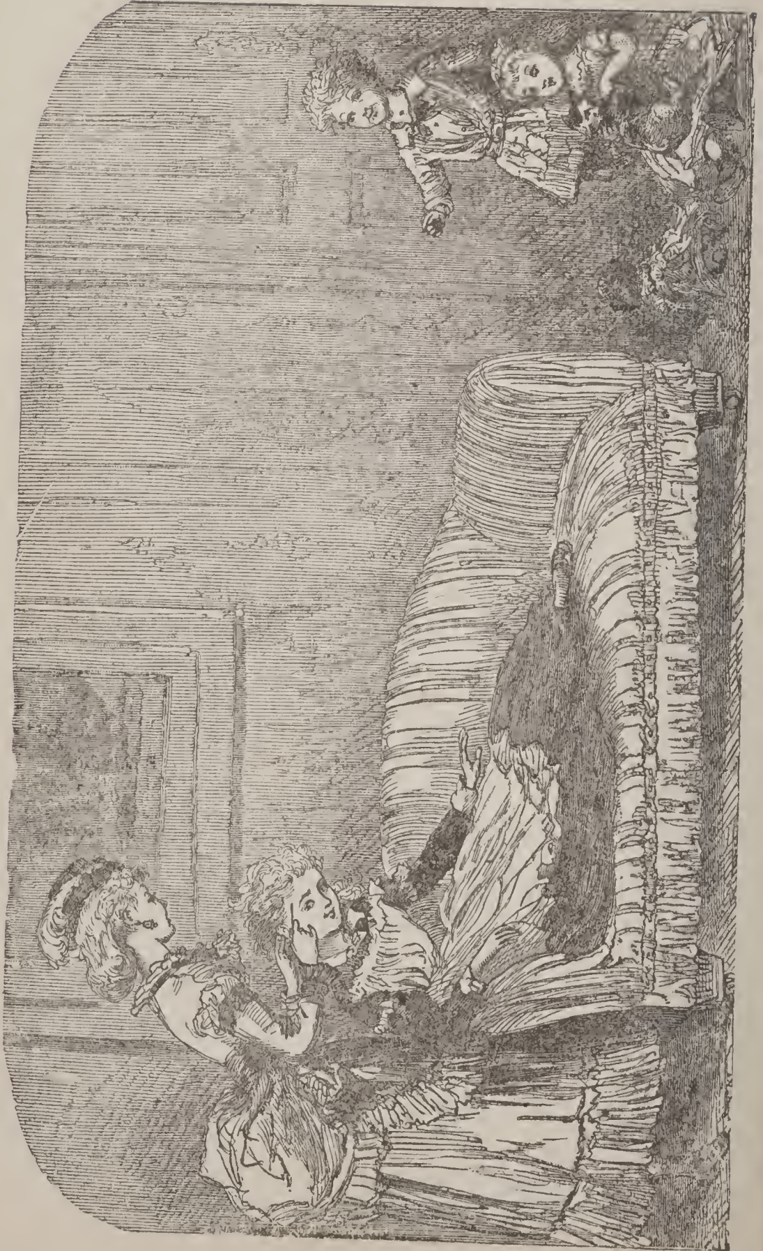
“PUNCH!” SAID ROSE, IN THE TONE OF ONE GIVING THE ORDER “FIRE!”